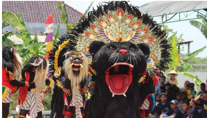
Figure 3. Barongan art performance (documentation: duto simo rekso studio)

Local culture is a culture that contains goodness for human life and is recognized by the local community and can grow according to the times (Ihsan et al., 2019). One of the local cultures in Demak is barongan art. Barongan is one of the unique arts that must be preserved because it has local cultural wisdom values (Ibda, 2019). Barongan art is not only an art performance, but also a reflection of the culture and traditions of the Demak people. By introducing barongan local culture to elementary school students, students can learn about cultural heritage and train students to participate in preserving local culture. In addition, students will also gain an understanding of the uniqueness of the tradition, its history, positive values and the role of local culture in society. Through barongan art as a learning resource, it is hoped that it can bring out a sense of love and pride in students towards their local culture. Therefore, barongan art is very appropriate to be used as a learning resource for students, because the local cultural values contained in barongan art make a significant contribution to the education and development of students regarding local cultural history.