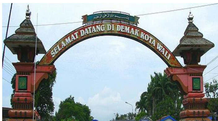
Figure 2. Welcome gate in Demak

The results showed that Demak Regency is rich in history and the legacy of the saints, so Demak Regency is known as the "City of Guardians". In addition to religious heritage, Demak is also rich in culture and traditions that are still attached and preserved today, one of which is the art of barongan. Demak barongan art is an artistic tradition that has been passed down since the days of the Demak Kingdom and still exists among the Demak people today. Demak barongan art is very popular among young people, this is evidenced by the interest of many young people in joining various Demak barongan art studios, one of which is the Duto Simo Rekso studio in Trengguli Village, Wonosalam District, Demak Regency. With so many barongan studios in Demak district, it is hoped that it can become a place of learning for young people, especially school students who want to participate in preserving and developing the local art of barongan. Barongan art is not only entertainment for children, but barongan art can also contribute in shaping character and positive values towards students. Therefore, it is important to continue to support barongan art as local wisdom and understand the educational values contained in it.