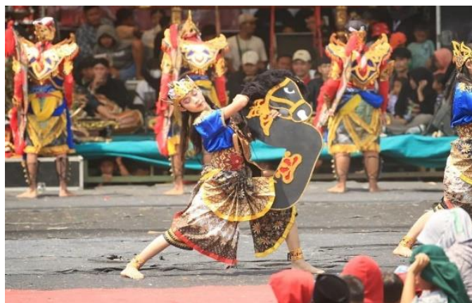
Figure 5. Jaranan dance on barongan (documentation: duto simo rekso studio)

This is evidenced by the dances contained in barongan, one of which is the hussar dance, this dance means that we as humans must be gallant, strong, alert, in the face of anything that prevents us from the path of truth. Therefore, barongan art is often used as a tool to convey the message that life is always side by side with the environment (Iryanto, 2022).