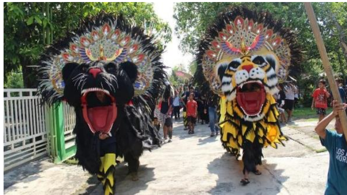
Figure 4. Singo barong costume

Every performing art is a collective art, meaning that it requires several components that require them to work together harmoniously (Widiastuti, 2019). Likewise with the barongan art performance which certainly cannot be separated from the cooperation between team members both between dancers and wiyaga, they all work together to create a good and interesting barongan performance. One form of cooperation in the art of barongan is in the singo barong dance. The costume worn by the singo barong player consists of a barong head that weighs around 8-10 kg, so it requires 2 players to lift the singo barong, they work together in moving the singo barong head during the barongan performance. Without cooperation, the barongan movements would be messy and the aesthetic element would be lost (Halimah & Sabardila, 2023). Cooperation in barongan art brings educational values to students. One of them is by seeing barongan art performances, students can better understand the meaning of teamwork, besides that students can better understand and appreciate roles and be responsible for their duties.